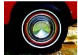
Wheel trims should look like this beautiful example...