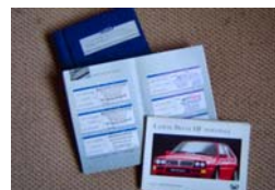
Return all books!