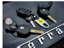
Car keys should all be returned, none lost!

You should make sure the car is nice and clean so that it is easy to inspect. The car should be quite clean and tidy inside, too.