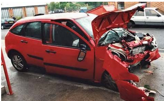
This is unacceptable condition. Did you realise that? All this stuff boils down to common sense. No need to spend money on the BVRLA guide, IMHO. Full details on finance doc.

This is not everything, of course, but you get the idea, I hope.