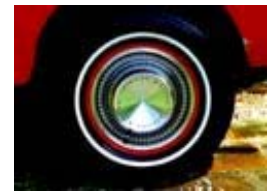
Wheel trims should look like this beautiful example...