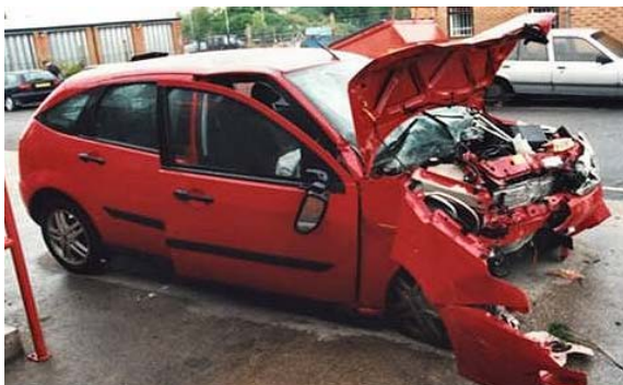
This is unacceptable condition. Did you realise that? All this stuff boils down to common sense. No need to spend money on the BVRLA guide, IMHO. Full details on finance doc.

This is not everything, of course, but you get the idea, I hope.