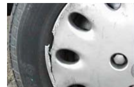
...not like this! Duh!