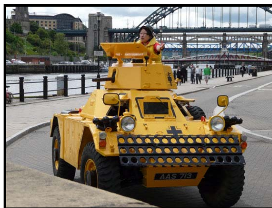
As seen on...